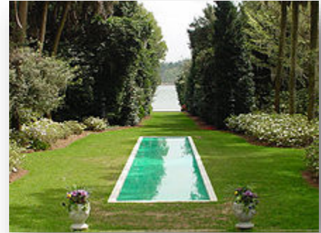
Maclay Gardens Reflection Pool