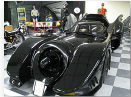
The Tallahassee Automobile Museum